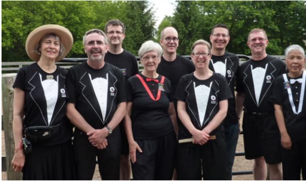
CardAthon, June 2010