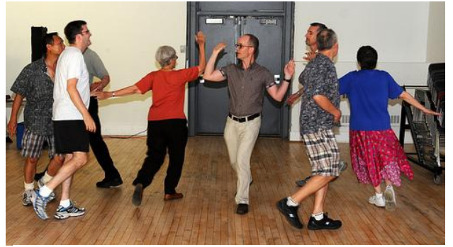
July 15 Club Dance