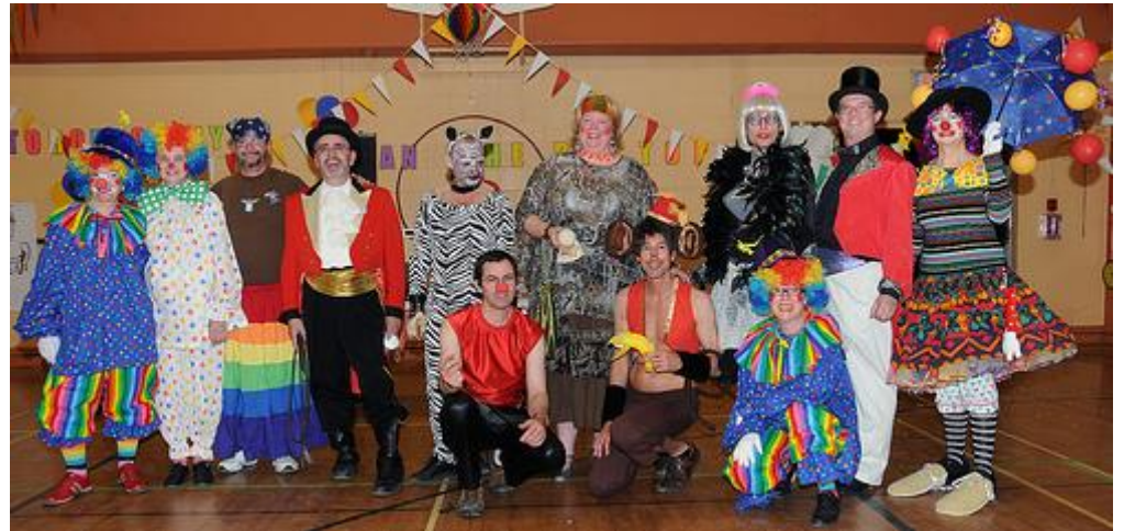
Scot Across The Border 2010 - Fan The Big Top