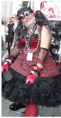
CSFF 2010 - Crystal