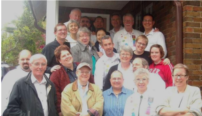
Toronto & District Convention - May (Brunch at Colleen's)