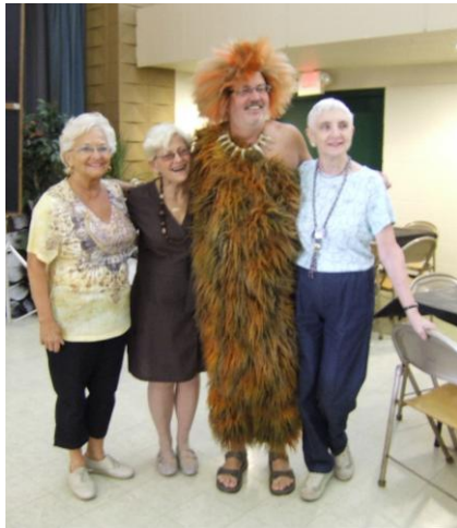
Grand Rapids MI April 2010 Yellowrock In Bedrock